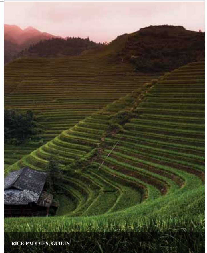
RICE PADDIES, GUILIN