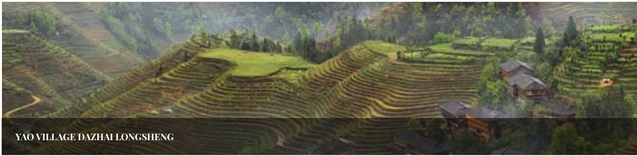
YAO VILLAGE DAZHAI LONGSHENG