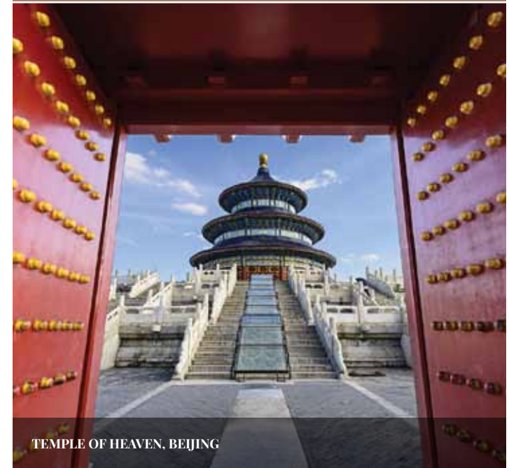
TEMPLE OF HEAVEN, BEIJING

All itineraries are fully customizable to accommodate our guests' interests, lifestyle and desired purposes. You may also create your own journey by selecting any worldwide destinations of choice. We will build a custom-crafted experience for you.